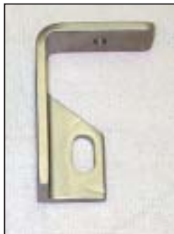
Port-side front mounting bracket

This is the bracket hardware included with the kit that you will need for installation.