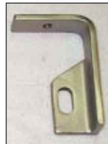
Starboard front mounting bracket