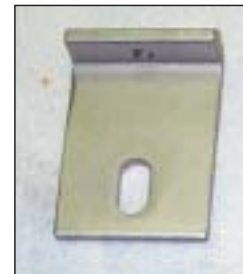
Universal Rear Mounting bracket. (This mounting bracket can be used for either Port or Starboard Rear)